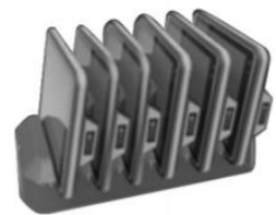
Multi-tablet Charging Station