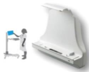
VESA Mount Kit