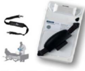
Hand & Shoulder Strap