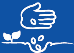
Soil and Seed